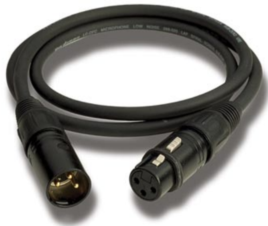
BRYSTON BALANCED XLR CABLE

Video cables also operate at very high frequencies - typically 5-6 MHz for Composite and S-Video and 8-30 MHz for Component Video depending on the scan rate and resolution. So again understanding the wavelengths of the signals and interfaces involved is important.