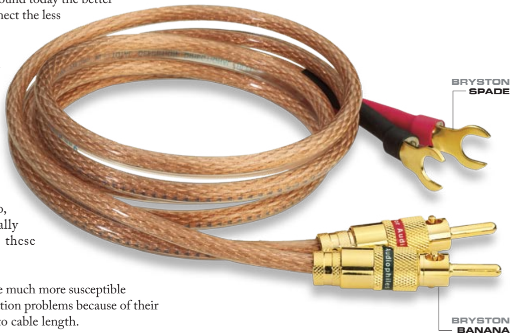
BRYSTON SPEAKER CABLE

Bryston highly recommends keeping the speaker wires as short as possible and utilizing XLR balanced lines if available. Given the choice of long interconnects and short speaker leads or short interconnects and long speaker leads – choose long interconnects (preferably Balanced) and short speaker leads. With digital and video cables finding out the sending and termination requirements is very important due to the very short wavelengths relative to cable lengths involved.