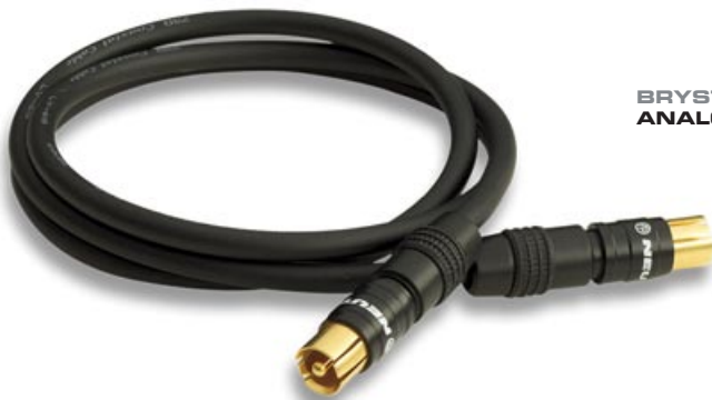
BRYSTON ANALOG/DIGITAL/VIDEO CABLE

We at Bryston, do not think cables should be 'voiced' to sound a specific way. The best cable is NO cable at all so we contend that the best cable is the cable that changes the signal the least.