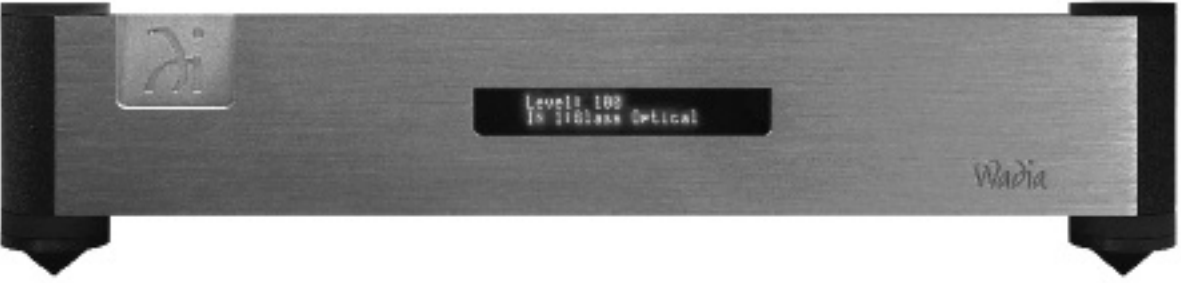
Wadia 521 Decoding Computer